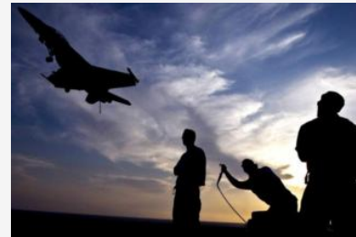
USS Enterprise, nicknamed "Big E", has been deployed in almost every conflict and crisis around the world but will be decommissioned in December 2012

Although US installations in Turkey, Israel, Djibouti and Diego Garcia are not in the CENTCOM area of responsibility, they could also be used in the event of any conflict with Iran.